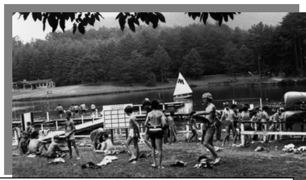
CRM waterfront circa 1970